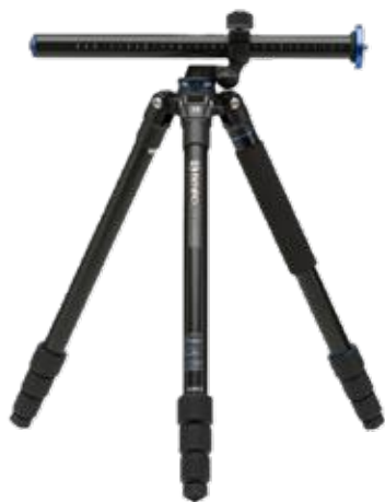
▲ Tripod with a tripod ball head

Interface is also possible a through hole designed for M6 screws (hole between the ribs visible in view A, C) using a T-slot nut to attach the camera to a 3D bar (3D Bar is not part of 2D DIC set, and is only applicable in this system via 3D Expansion kit or in standard 3D DIC System).