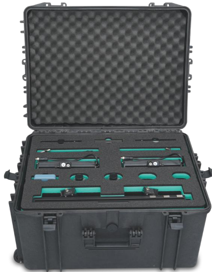
◀ XS - 2D DIC dustproof case

The outer dimensions of the case are 687 × 528 × 366 mm, with a weight of approximately 15 kg.