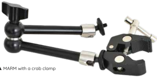
▲ MARM with a crab clamp

For large fields of view, a custom solution is applied. In many cases, separate light stands are used.