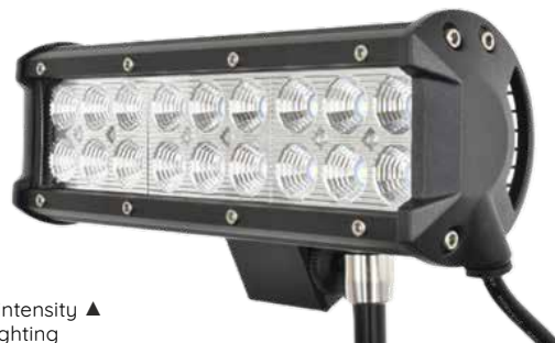
High-intensity ▲ LED lighting

For medium-sized applications, multiple light sources should be considered.