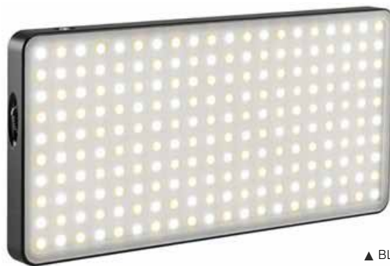
▲ BLED Light

The X-Sight 2D system comes with two light sources in total. One BLED which is a battery-powered light, and the other LED light is powered by an electrical grid and have higher light intensity.