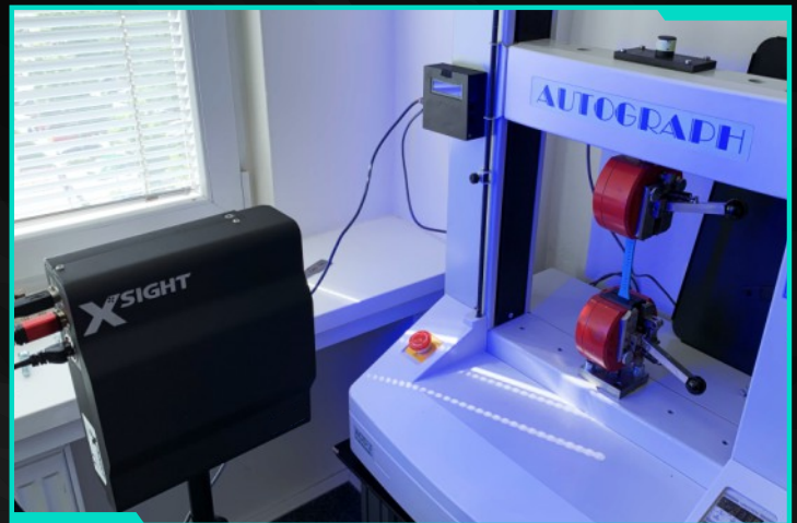
Tensile test set-up

The transversal software module allows to measure transversal strain and other mechanical properties in real-time. It enables to evaluate Poisson's ratio and enhances the measurement process with automatic edge detection.