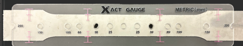
Xact Gauge (Marking Stencil) with a 50 mm Gauge Length Points