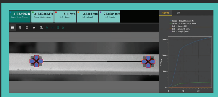
Strain and Stress Measurement Analysis

The values of strain and stress, with stress being computed from the force measured by the UTM, are then evaluated to acquire the material model of the examined specimen. This analysis provides the characterization of the specimen's mechanical response. Owing to the capabilities of Swift 3D, the process is both robust and straightforward to perform, enabling reliable data acquisition and simplifying the overall procedure.