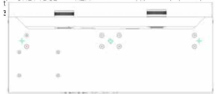
▲ The bottom plate of the ONE – 3/8" UNC in the middle and M6 screw holes

The ONE LARGE S unit can be mounted via a 3/8" UNC threaded hole in the middle of the bottom plate to a tripod head for portable use. However, a common way of mounting